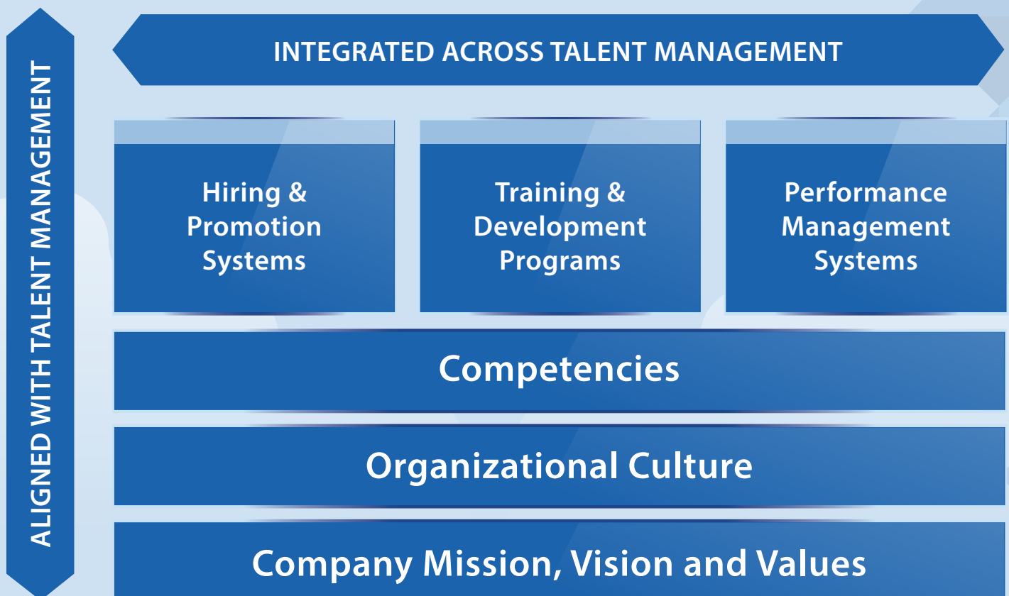
Figure 1 – Talent Management Alignment and Integration

When using competencies as the framework, a company's talent management systems are more integrated. Competencies create a common performance language that can be used for greater consistency in hiring, developing and managing talent. With a well-defined competency model – or set of competencies for a job, job family, role level in the organization, stakeholders now have the ability to define, describe and discuss performance the same way using a common dialogue.